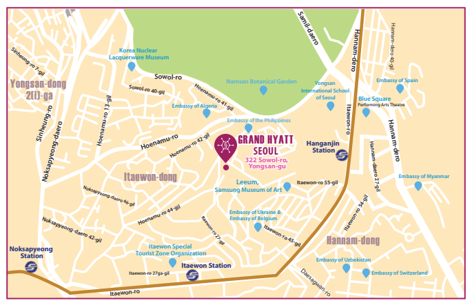
Hotel Location Map

Without breakfast: ..... https://book.passkey.com/go/Rchemconasia2019